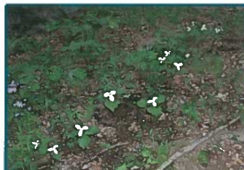
Trillium grandiflorum dance across the wildflower collection. Visit the garden at its peak now. See Bruce Carley's website:

Norway Maples reproduce so prolifically and so vigorously that they crowd out all competing tree species. Continued control of their reproduction has prompted a discussion of removing mature seed-bearing trees in the Arboretum. However, these trees appear on both town and private property, and their removal is controversial. Control of invasive plant species remains a complex issue. For more information on efforts to identify and control invasive species in New England, visit the New England Wildflower Society's website ( www.newfs.org ) and review the "Conservation" page for Invasive Plants topics.