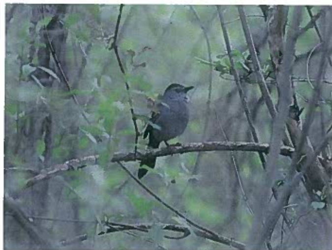
PHOTO: A catbird discovered at rest during the Anniversary Day.