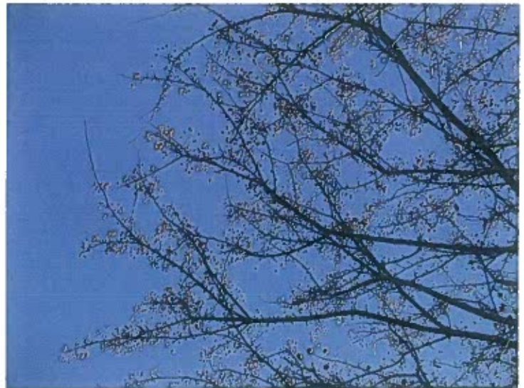
PHOTO: A crabapple tree, 'Snowdrift', near the Taylor Rd. parking lot on a crisp November morning. The fruit was enjoyed by goldfinches and a single cedar waxwing.

The Acton Arboretum does have a number of plants that are edible. It also contains a number of plants that are mildly toxic to dangerously poisonous. If you don't know a fruit or are not sure then don't eat it. If the fruit is white in color it may be poison ivy. Avoid all white fruits. The red fruits of jack-in-the-pulpit, the